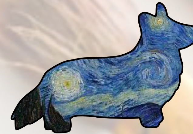
Vincent van Gough